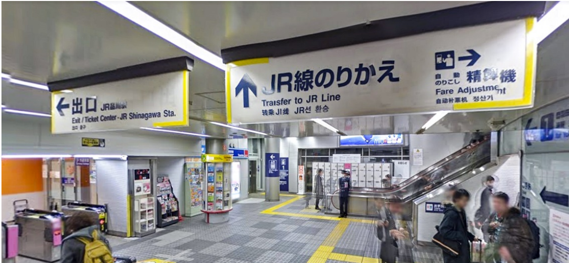
Don't exit. Follow 'Transfer to JR Line'