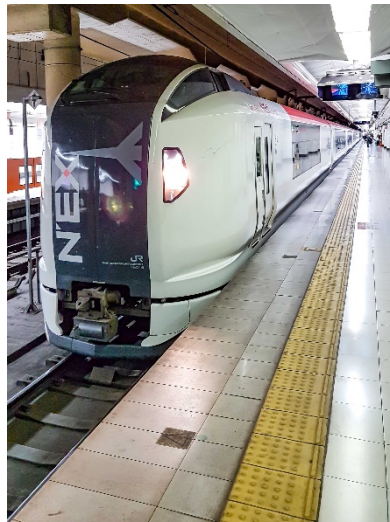
NEX train exterior...