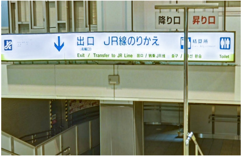
Follow Signage for 'Transfer to JR Line'