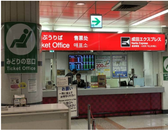
Narita Ticket Office