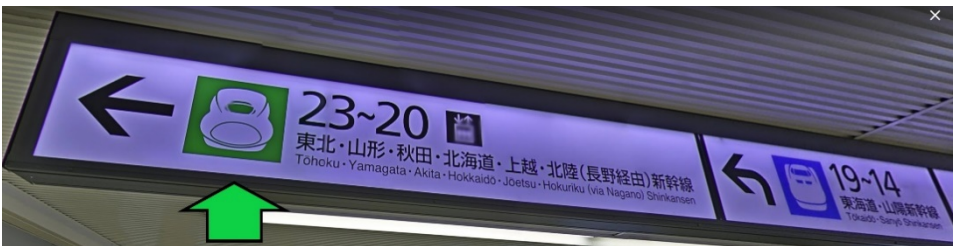
Follow the Green Shinkansen Signage

In Tokyo Station, you can transfer in under 10mins to the Shinkansen but it's a good idea to leave yourself a bit of extra time as a buffer and to buy a few supplies for the journey. There is no shortage of stores to stock up on supplies! There is a small coffee shop inside the Shinkansen gates too. Tokyo station, although well signed, is a bit of a rabbit warren being the world's 8 th busiest railway station. Follow the signs for the Green Shinkansen (not Blue) on platforms 20-23.